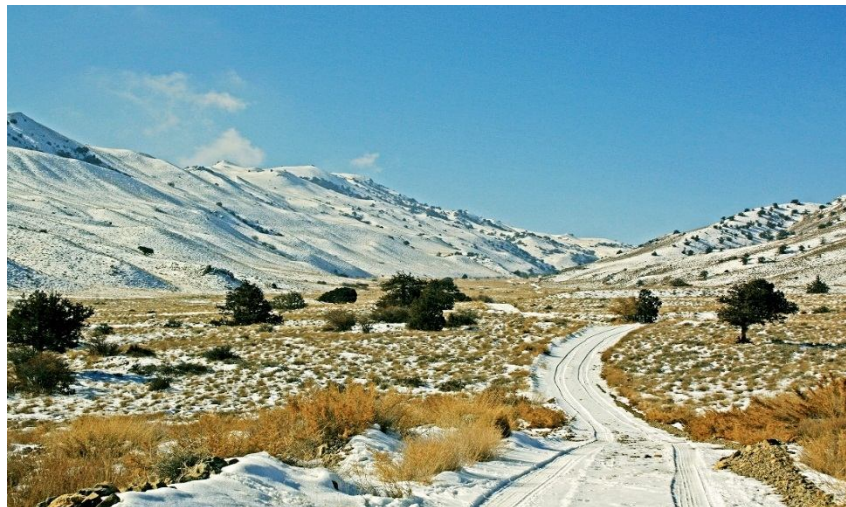
Figure 2. Almesh Valley, Golestan National Park

The park covers forested areas in the east, semi forested to bushlands in the center and semi desertic areas in the east. Natural and scenic beauty together with high biodiversity are features of the park (Fig. 2).