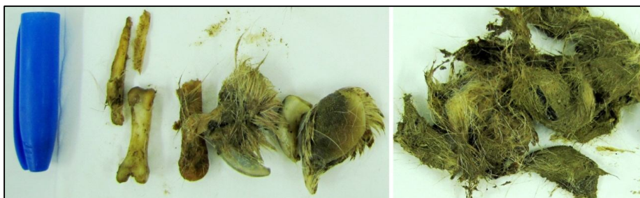
Figure 3. The prey remains of P. pardus in Golestan National Park.

protocol. The Control region of mtDNA was PCR-amplified using primers including L15995 (Taberlet et al. , 1994) and H16498 (Fumagalli et al. , 1996).